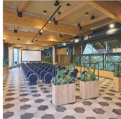
TUHINJKA CONFERENCE HALL